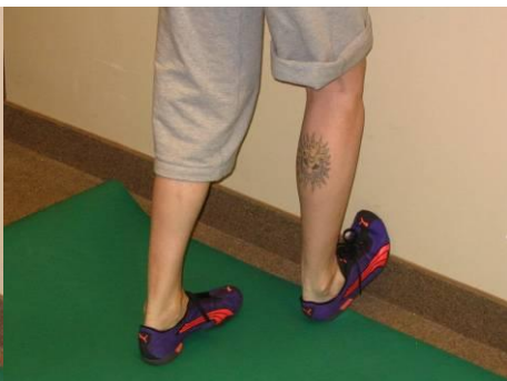
With knee bent