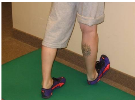
With knee straight